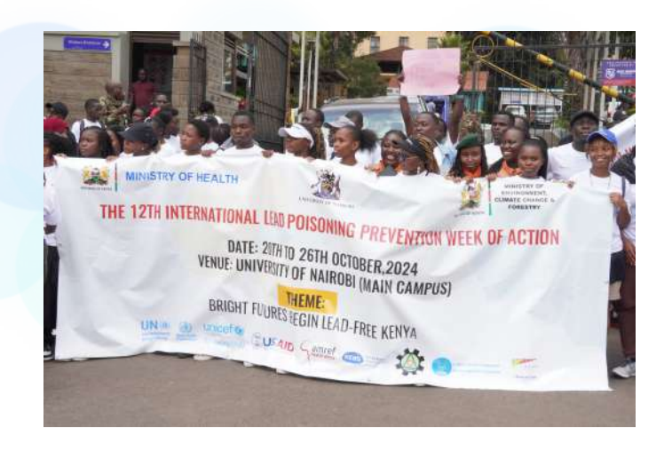
CEJAD was recognized and awarded for the efforts in raising awareness and leading in policy advocacy review for Lead elimination in Kenya