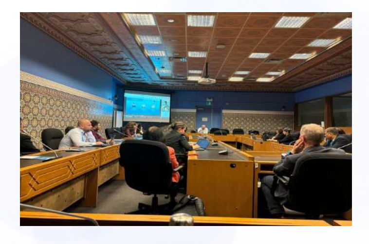
46th Open-Ended Working Group (OEWG-46) in Montreal, Canada