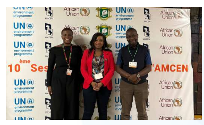
CEJAD at the Tenth Special Session of AMCEN in Abidjan