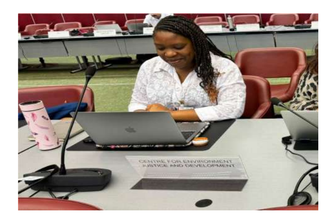
Open-ended working group of the Basel convention in Geneva.