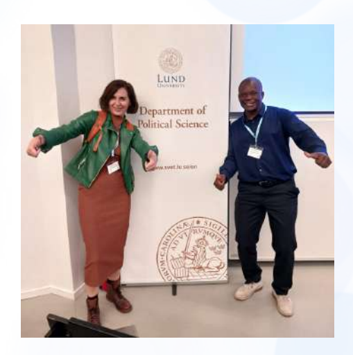
The Local Democracy Academy at the University of Lund organized by ICLD Sweden