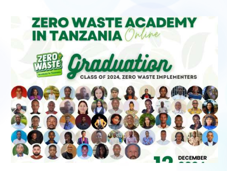
Zero Waste Academy organised by Nipe Fagio Tanzania