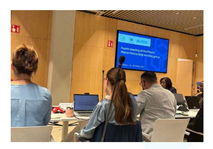
CEJAD's project on 'Advancing non-toxic circular economy in Kenya' was recognised as one of the Outstanding projects by the Plastic Waste Partnership of the Basel Convention.