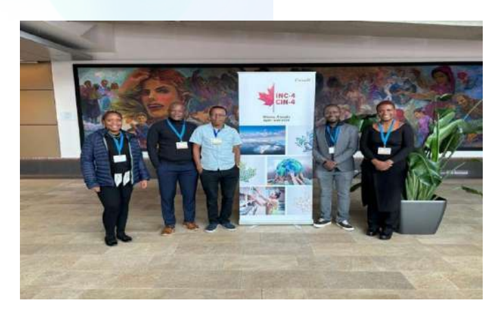
CEJAD team during INC4 that took place in Ottawa, Canada