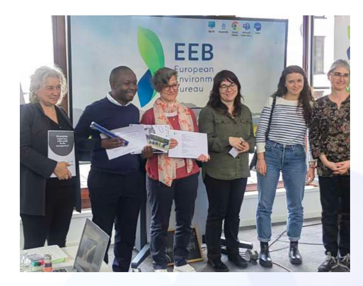
NGO capacity building convened by the European Environmental Bureau (EEB), in Brussels, Belgium.