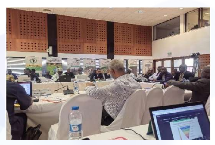
Workshop on regional harmonization of rules governing the registration and management of pesticides in the Sahel and West Africa in Cape Vade